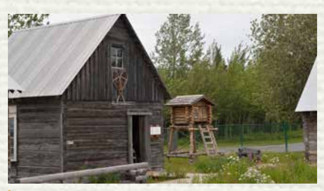
Historic Cabin Park, located in Old Town Kenai.

"Kids didn't want to learn before, but now they all want to learn. So they come to me to learn how to fillet the fish, what to keep, what to throw away, how to brine, how long to smoke it. It's all a big process of learning."