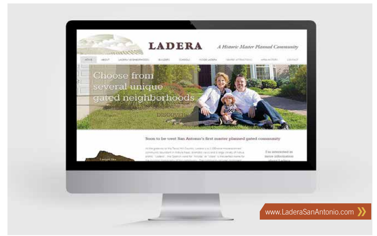
> Screenshot of the new Ladera website, www.LaderaSanAntonio.com.