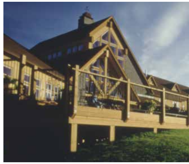
CATC's award-winning Talkeetna Alaskan Lodge.

CIRI Alaska Tourism Corporation (CATC) is pleased to announce that its Talkeetna Alaskan Lodge is the recipient of the Wine Spectator's Award of Excellence for the thirteenth year in a row. Resurrection Roadhouse, the on-site restaurant at CATC's Seward Windsong Lodge, marks its fourth consecutive year winning the same award.