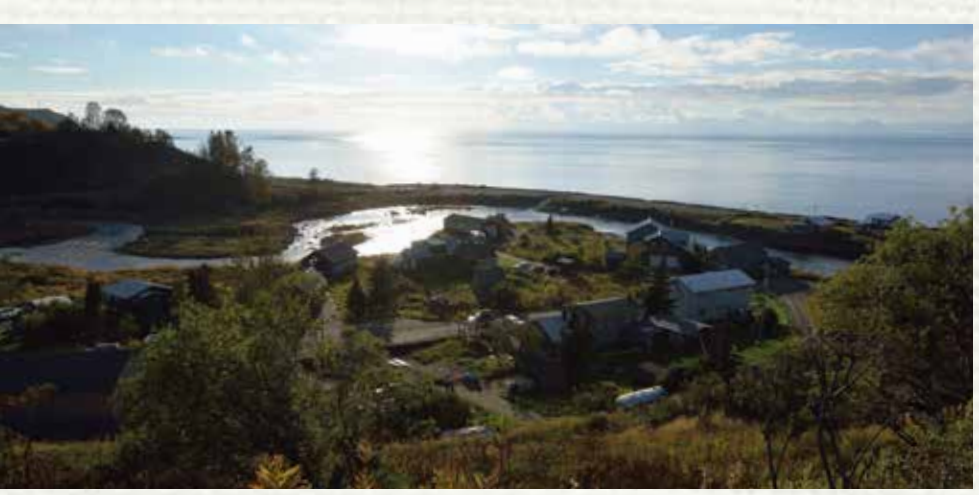
A key to retaining heritage in Ninilchik is maintaining the subsistence way of life, which has local leaders fighting for subsistence rights—a long, slow struggle.