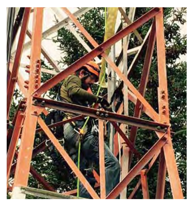
> Fire Island Wind workers participate in a Competent Climber safety training held by UpWind Solutions in June.

Each of the 11 turbines at Fire Island Wind (FIW) stands about 262 feet tall—and for the crews who maintain and repair those turbines, working at such great heights carries with it inherent risks. That's why CIRI staff and FIW Operations and Maintenance teamed up with contractor UpWind Solutions to hold a four-day Competent Climber safety training course in June.