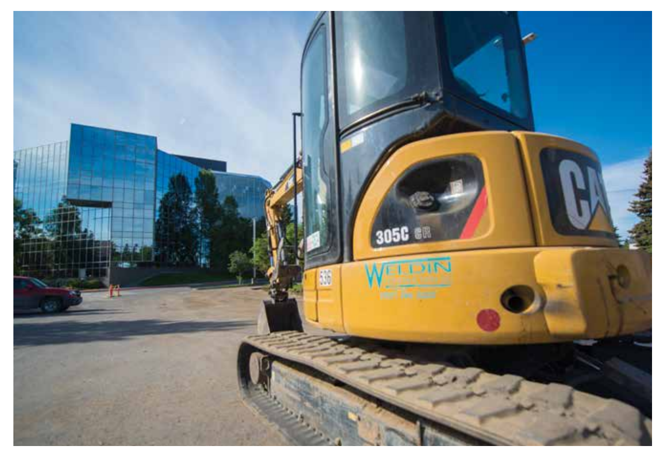
) Weldin Construction is leading the effort to improve the 2525 C Street parking lot, a project aimed in part at attracting new tenants to the building.