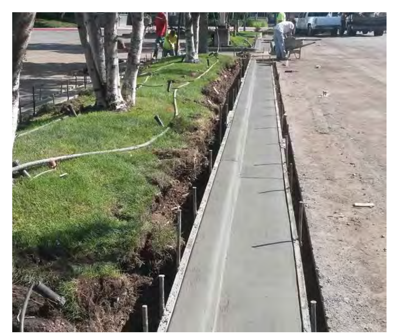
> Weldin Construction workers pour new curbs around existing trees in the former CIRI Headquarters parking lot as part of a civil construction project.

The project is slated for completion by the end of August. ■