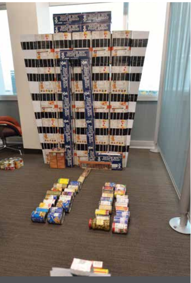
The Legal and Real Estate Departments won for Creativity with their replica of the Fireweed Business Center, including the deck, roundabout and even China King in the parking lot.

CIRI departments teamed up to collect canned goods for donation, then designed and constructed sculptures from their cans. Teams competed in several categories, including "complexity," "creativity" and "quantity." CIRI hosted a lunch for the winning teams, with Shareholder Relations providing desserts as a thank-you. But the real winner is the Food Bank of Alaska, who received a total 3, 580 pounds of canned goods and coffee once the sculptures were disassembled.