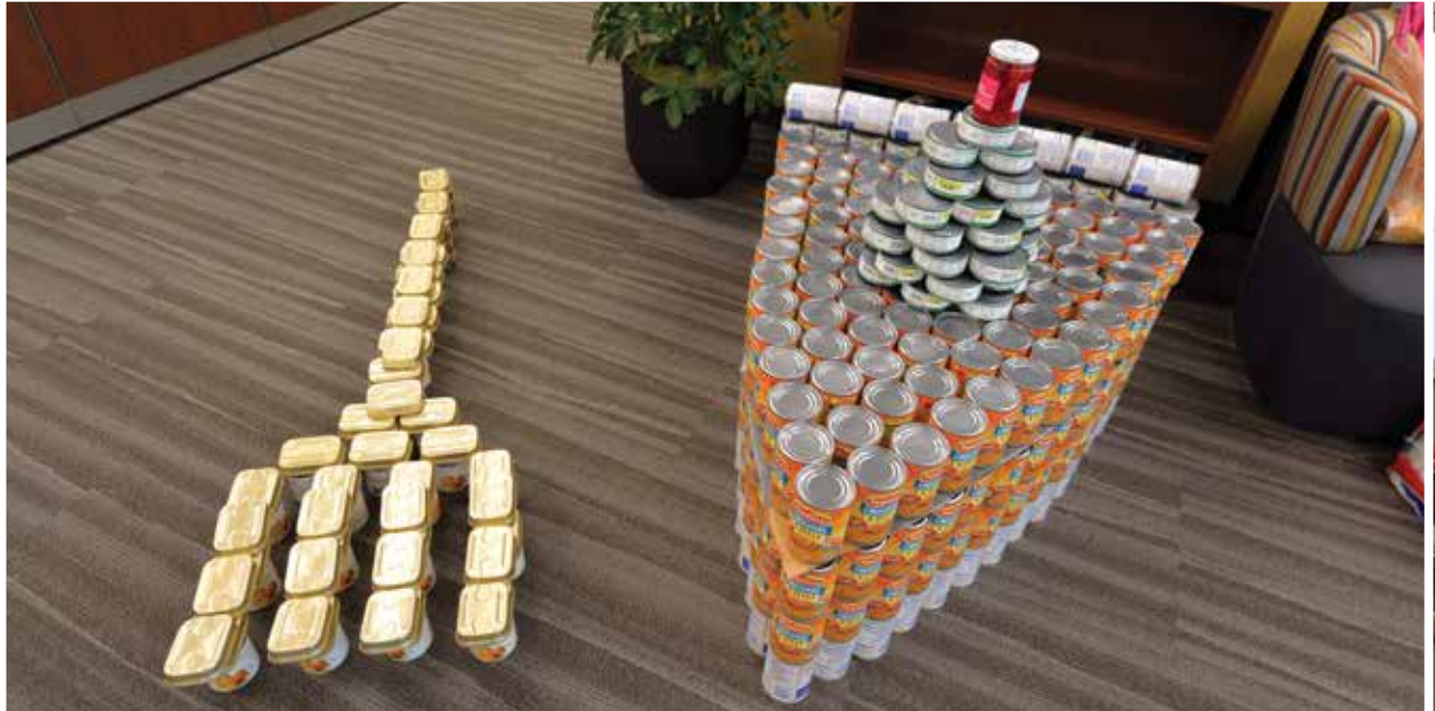
> CIRI's Accounting and Finance Departments collaborated to serve up a piece of pie—and a fork to it eat with.