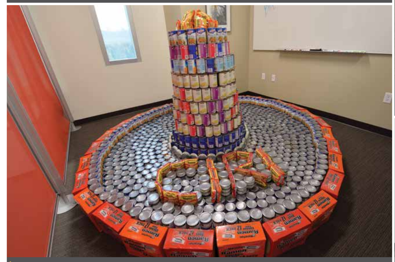
After successfully negotiating a bulk quantity discount with Walmart, Human Resources, Risk Management and Government Services successfully collected the most canned goods (1,878!) to create a colorful sombrero, landing the Quantity prize.