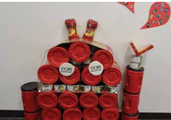
> IT kept things technical with their interpretation of an Android.