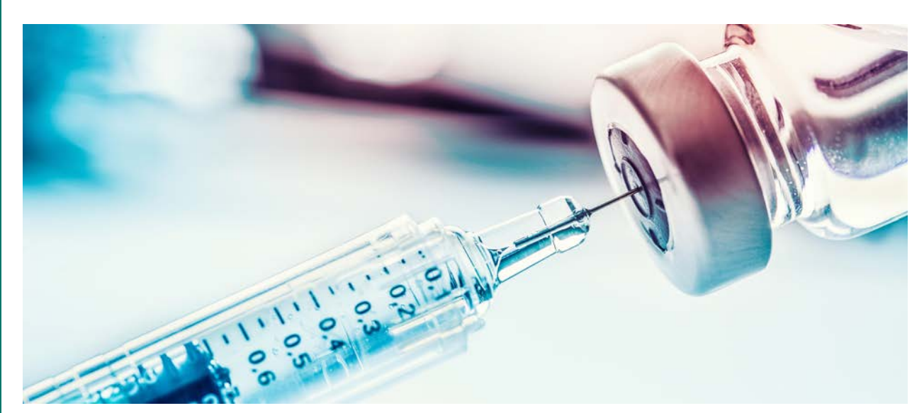
During the COVID-19 pandemic, the flu shot will be essential in reducing the impact of respiratory illnesses in the population and resulting burdens on the healthcare system.

A program of the U.S. Centers for Disease Control and Prevention (CDC), National Immunization Awareness Month is held each August to highlight the importance of vaccination for people of all ages.