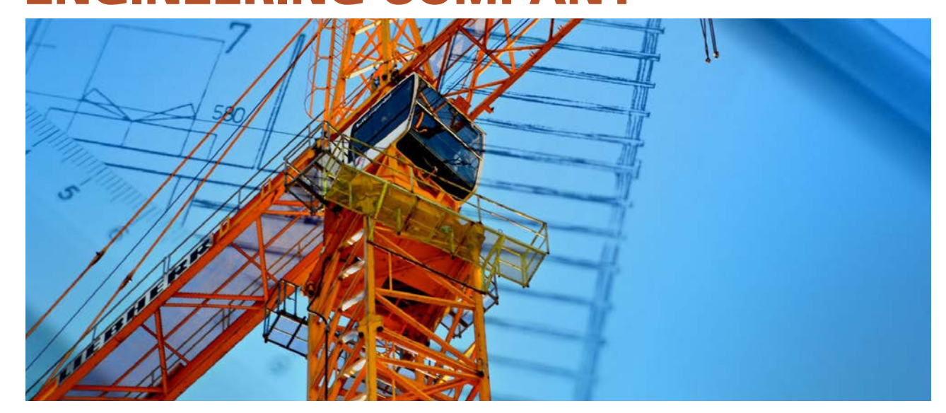
Addition of LBYD Engineers to NWG Expands the Companies' Design-Build and Commercial Capabilities

CIRI subsidiary North Wind Group (NWG) closed out 2020 with exciting news: On Nov. 30, the engineering, environmental, construction and technical-services company announced it had merged LBYD, Inc. (LBYD Engineers) into NWG as a subsidiary company.