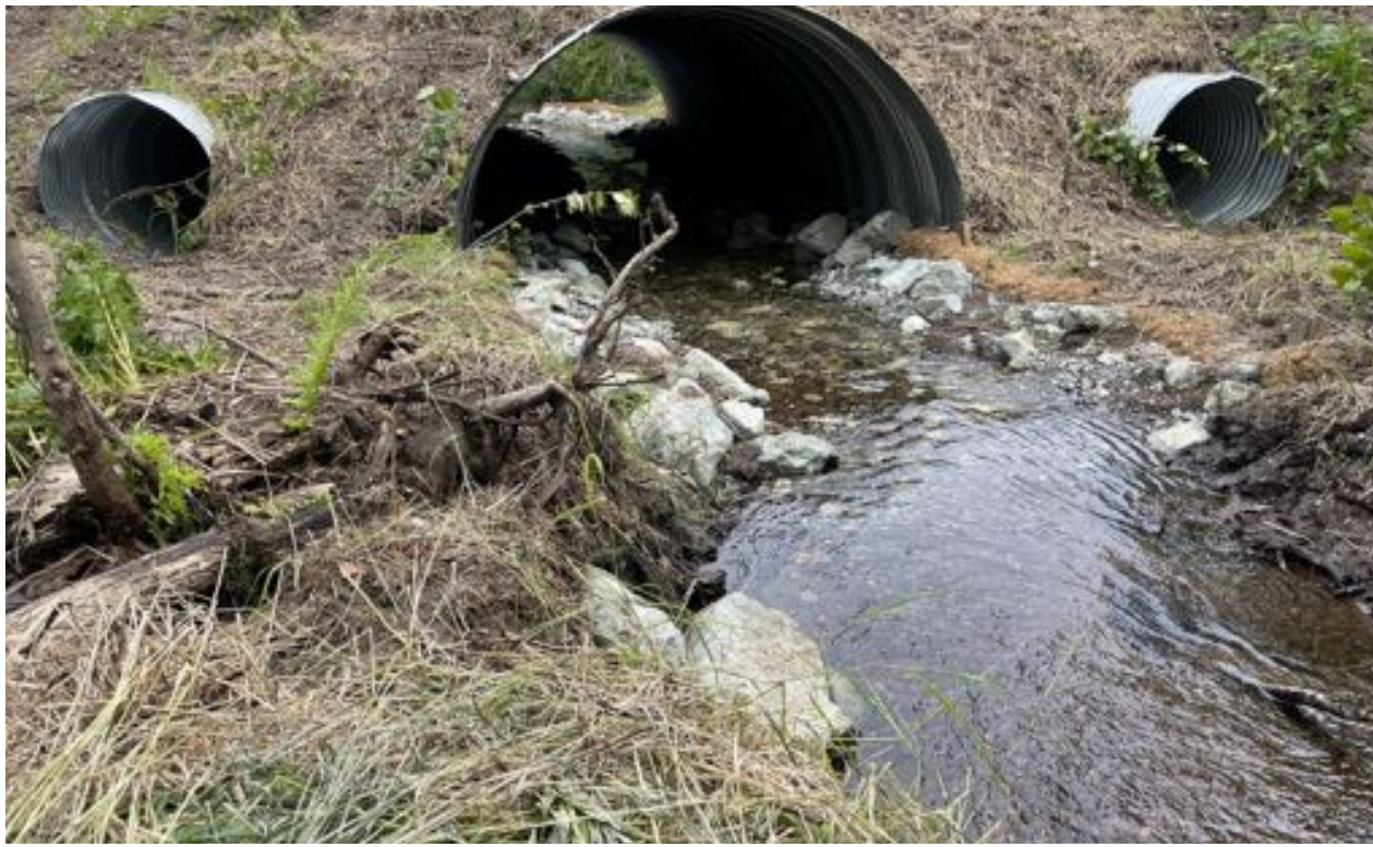
In 2021, TTCD worked with CIRI and other partners to replace culverts on tributaries of Indian Creek and the Chuitna River, opening a total of 2.8 upstream miles and 78 acres of habitat for the migration and movement of adult and juvenile salmon.

Recently Completed Projects Improve Fish Passage and Habitat in Tyonek, Alaska