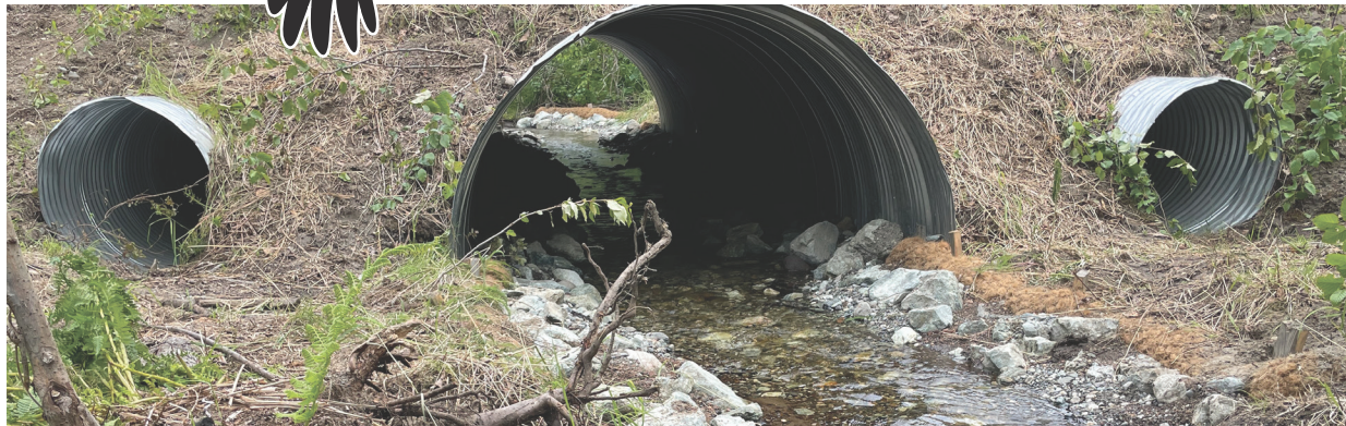
Culvert-replacement projects, such as this one in Tyonek, are aimed at increasing and improving salmon habitat.